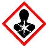
GHS08 Health hazard

H225 Highly flammable liquid and vapour.